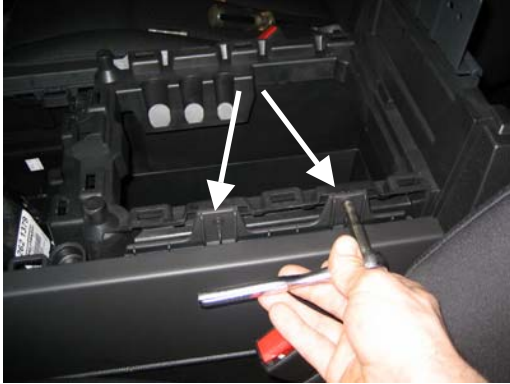
Remove hex head screws holding side of accessory pocket